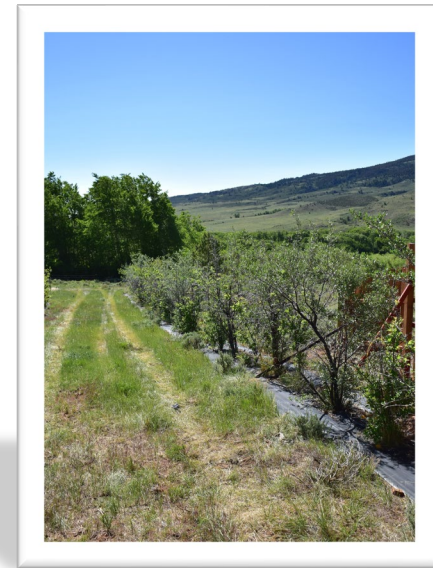
LIVING SNOW FENCES