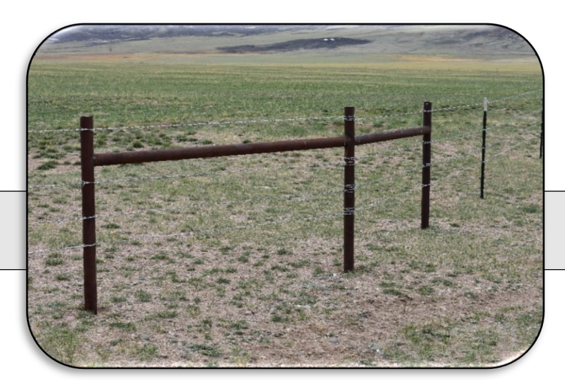
Wildlife friendly fence conversion, cross-fencing cost-share project