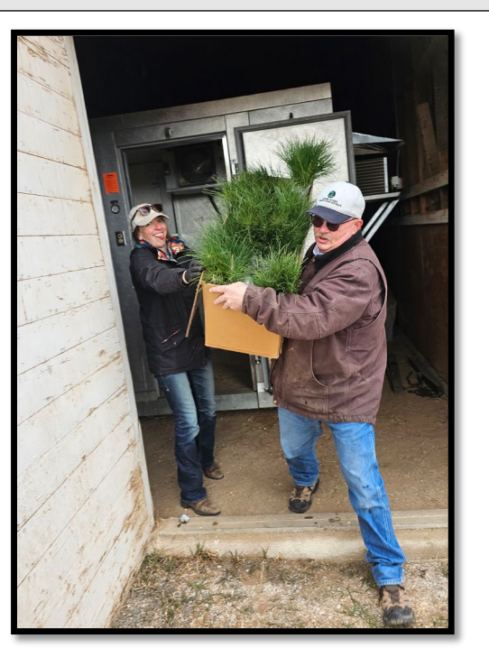
LRCD Staff prep and distribute trees at the annual tree & shrub sale.