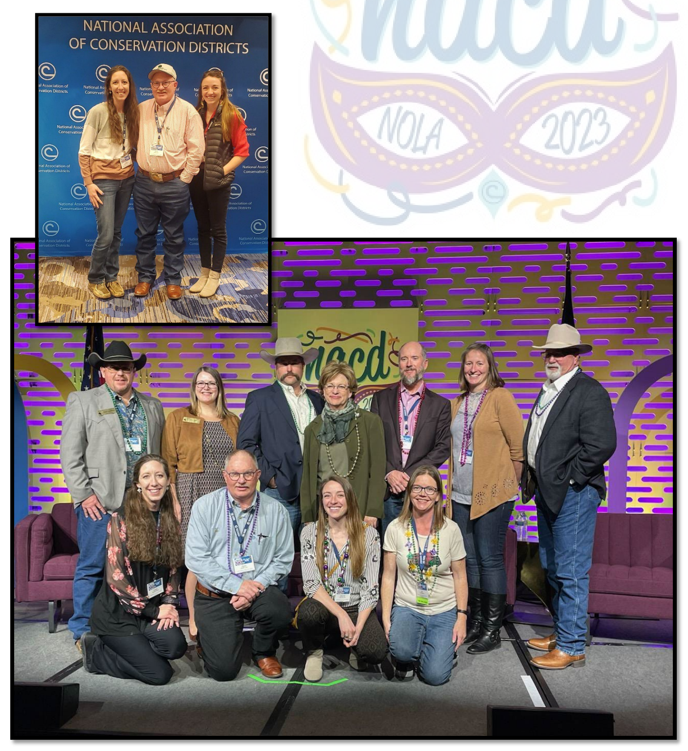
Wyoming was well represented at the National Convention in New Orleans, LA. Members of WACD, WDA, NRCS, LRCD, and four (4) other Wyoming conservation districts were present at the 2023 meeting.

District Staff had the privilege of joining members of the Wyoming Association of Conservation Districts (WACD), Wyoming Department of Agriculture (WDA), Natural Resources Conservation Service (NRCS), as well as a number of other Wyoming Conservation Districts at the National Association of Conservation District's (NACD) annual meeting in New Orleans, Louisiana in February.