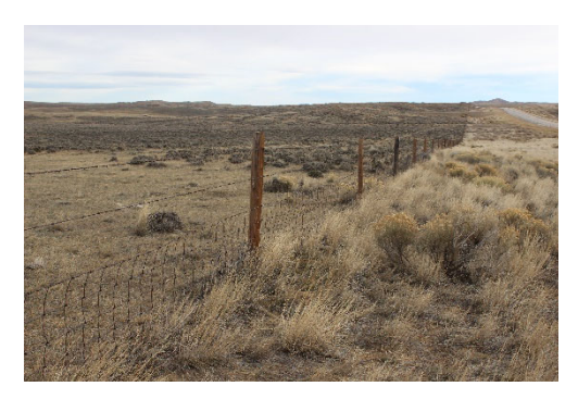
Woven wire fencing (old sheep fencing)

Landowners applied for and received funding to replace old sheep wire fencing with wildlife friendly fencing (1 project) and funded cross fencing (1 project) for improved pasture management.