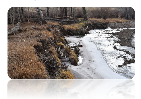
Bank cut modifications

The Big Laramie/Mountain Meadow property combined WWNRT grants ($50,000), WGFD, and USFWS and NRCS EQUIP funds to complete a 1,600 ft. segment of streambank improvements.