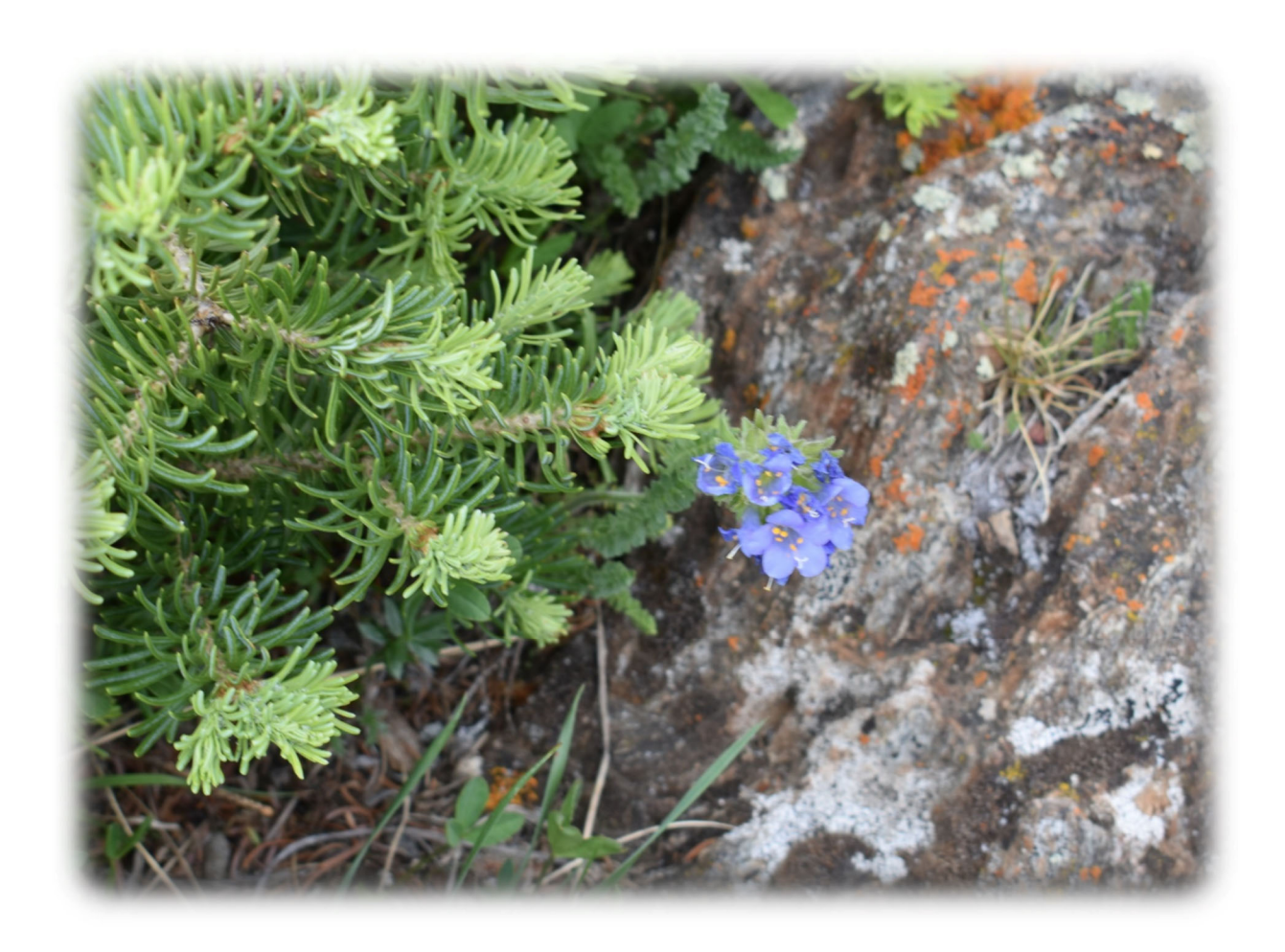
Libby Flats Plant Walk 2019

As a local government agency, it is the mission of the Laramie Rivers Conservation District to provide leadership for the protection and enhancement of Albany County's natural resources.